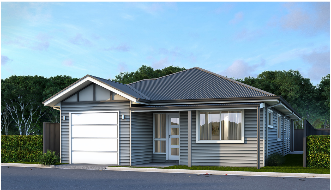
Image was produced prior to planning approval, statutory approval and commencement of construction and is subject to change. The information and image depicting interiors and exteriors are intended only as a guide and are not to be relied on as a representative of the final product.

A feature packed home, The Dangar has a clever open plan layout which includes a lounge room, dining room and a modern kitchen. The master bedroom features a private ensuite and the second bedroom has access to the family bathroom. The deck is the ideal place to sit back and relax, or to enjoy a glass of wine with friends.