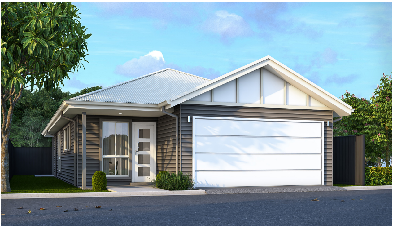
Image was produced prior to planning approval, statutory approval and commencement of construction and is subject to change. The information and image depicting interiors and exteriors are intended only as a guide and are not to be relied on as a representative of the final product.

Designed for easy living, The Jenkins is an inviting home. The open plan layout allows an easy flow between the lounge, dining, and kitchen, opening to an outdoor deck, perfect for entertaining. There are two bedrooms, the main with an ensuite, a spacious family bathroom and a study. A double garage completes this stylish home.