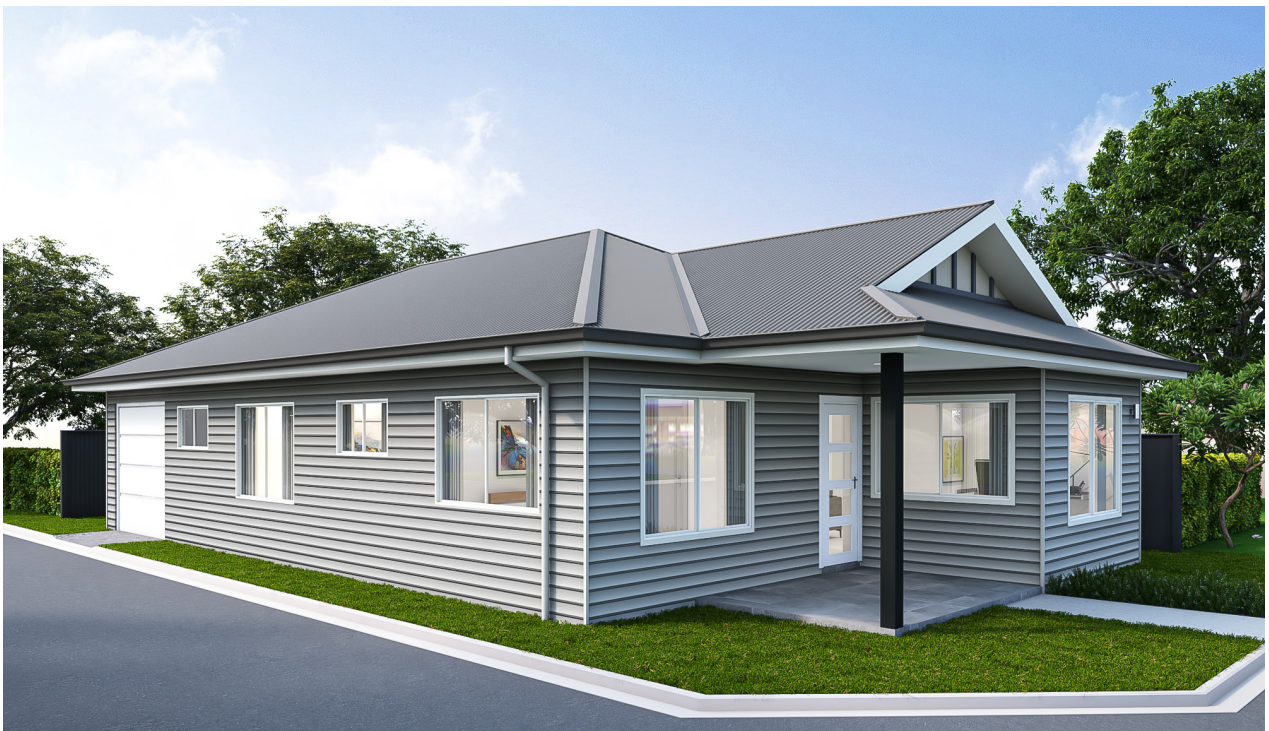
Image was produced prior to planning approval, statutory approval and commencement of construction and is subject to change. The information and image depicting interiors and exteriors are intended only as a guide and are not to be relied on as a representative of the final product.

From the welcoming porch to the practical layout, The Merton offers two large bedrooms (one features an ensuite), a family bathroom and a private study. An open-plan kitchen with island bench overlooks combined living and dining areas that are flooded with natural light. The indoor space opens to a generous deck, ideal for relaxing and hosting friends and family.