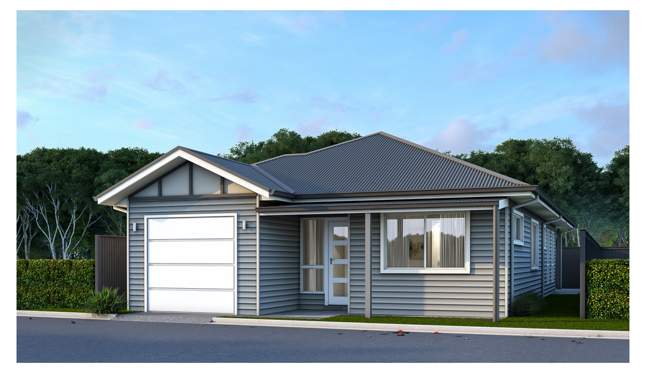
Image was produced prior to planning approval, statutory approval and commencement of construction and is subject to change. The information and image depicting interiors and exteriors are intended only as a guide and are not to be relied on as a representative of the final product.

A feature packed home, The Dangar has a clever open plan layout which includes a lounge room, dining room and a modern kitchen. The master bedroom features a private ensuite and the second bedroom has access to the family bathroom. The deck is the ideal place to sit back and relax, or to enjoy a glass of wine with friends.