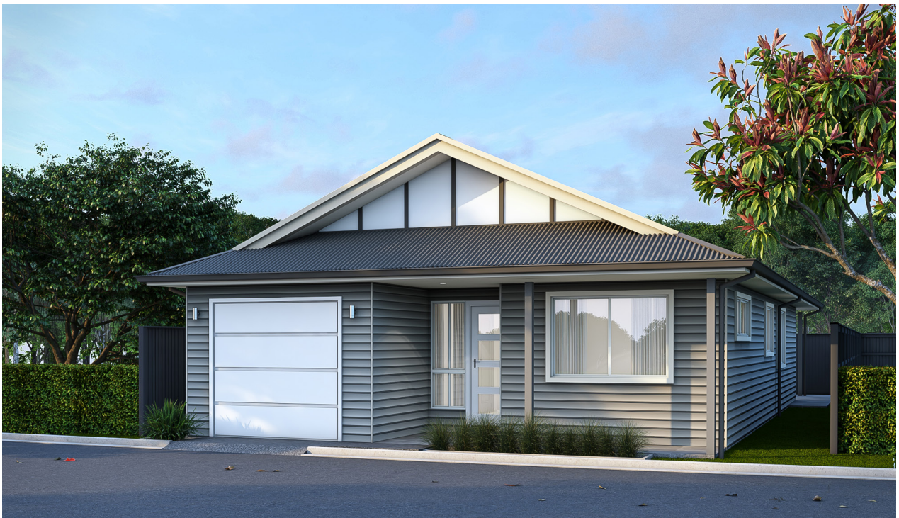
Image was produced prior to planning approval, statutory approval and commencement of construction and is subject to change. The information and image depicting interiors and exteriors are intended only as a guide and are not to be relied on as a representative of the final product.

The Forbes has all the features of modern day living. Step through the door into a spacious living and dining area, leading to a contemporary style kitchen. There are two generous sized bedrooms, both with built in robes, the main bedroom includes an ensuite and there is a family bathroom and a study. A lock up garage completes this stylish home.