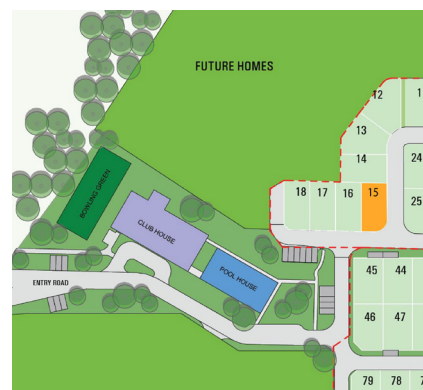
Image was produced prior to planning approval, statutory approval and commencement of construction and is subject to change. The information and image depicting interiors and exteriors are intended only as a guide and are not to be relied on as a representative of the final product.