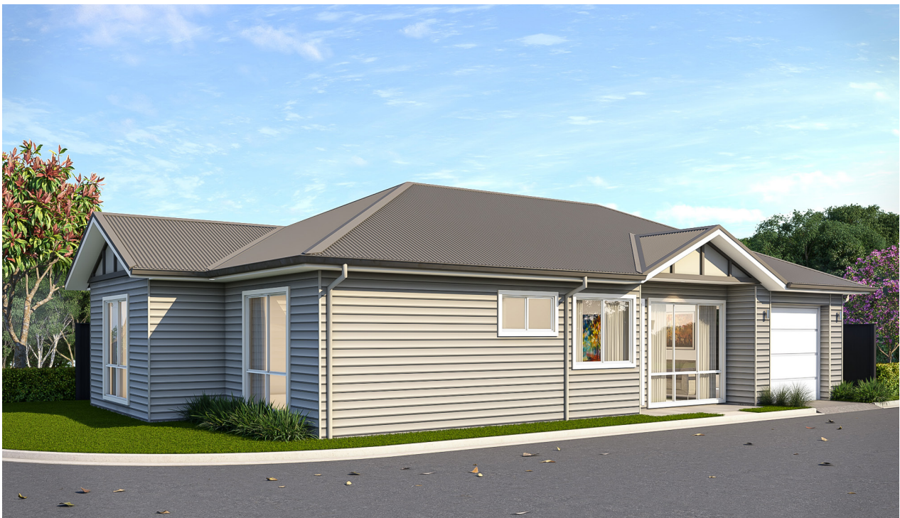
Image was produced prior to planning approval, statutory approval and commencement of construction and is subject to change. The information and image depicting interiors and exteriors are intended only as a guide and are not to be relied on as a representative of the final product.

The Arlingham is a downsizer's dream with two bedrooms with built in robes, a private ensuite plus a family bathroom and an open plan kitchen, dining and living space. This home offers the best of modern living with space to entertain both indoors and alfresco.